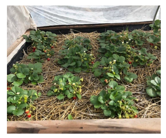
Figure 2. Strawberries grown under row cover.

For our trials we chose to grow day-neutral varieties because they produce fruit over a longer period. We started our strawberries from bare root plants by transplanting them into our raised beds in early May of 2018. It is important at higher elevations to plant once the ground is no longer frozen for the best transplanting success. Our plants were overwintered in 2018 until the 2019 growing season, so we only had one planting date. We chose to grow our plants for only two years because we needed the space in the raised beds to trial other crops. If you would like to have your space dedicated to strawberries, you can continue your plants in that space for more years than we did.