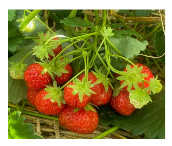
Figure 1. Mara de Bois berries growing in 2019.