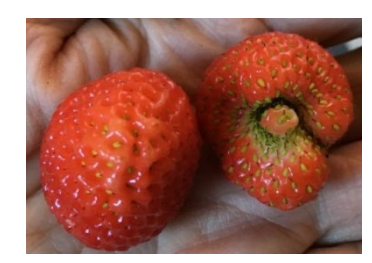
Figure 4. Lygus bug impact on strawberries.