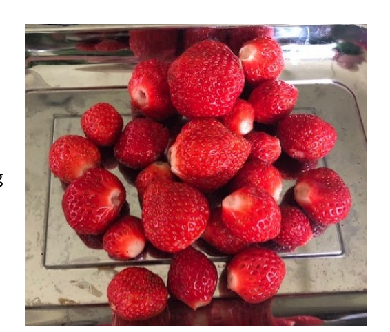
Figure 3. Mara de Bois fruit at harvest.

Day-neutral strawberry varieties can be harvested throughout the season, regular harvest optimizes fruit production. We harvested the fruit once they were uniformly red and firm. They began getting ripe in early to mid-July and were harvested through the middle of October. We checked our plants and harvested every other day or every few days to avoid rotting fruit. When harvesting the fruit, we cradled the berries in our hands, and pinched them off the calyx (the green leaves at the top of the fruit) to allow the berry to pop off nicely without bruising. We observed that the Mara de Bois (MB) variety had the highest overall yield in both berry number and ounces of fruit per plant. The fruit size was more variable than you would see from fruit sold at the market (Figure 3). Seascape (SS) did well but did not produce nearly as much as the MB variety. Albion (AB) performed much worse than