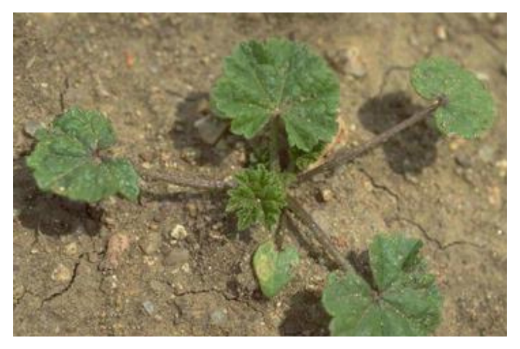
Common Mallow Seedling.

Common mallow largely produces by seed, but fragmented pieces of the plant can establish under the right conditions. As a result, management efforts that focus on removing the entire plant before it flowers and produces seed, are critical. As common mallow matures, it develops a long, woody taproot, so the younger the plant is, the easier the plant will be to remove by hand.