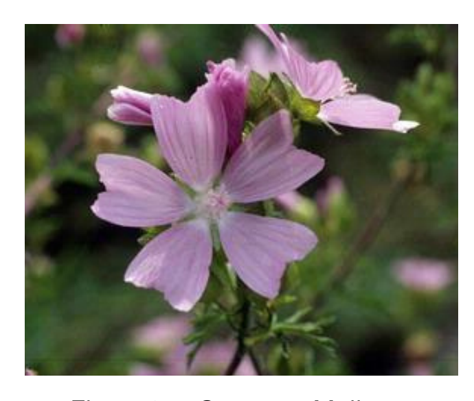
Flowering Common Mallow.

For more information on Growing and Giving, go to growandgivecolorado.org